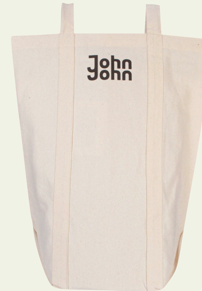
John John ORGANIC

Our heavyweight made of extra thick recycled polyester. Is this still a bag or already a real backpack? Need a little more?