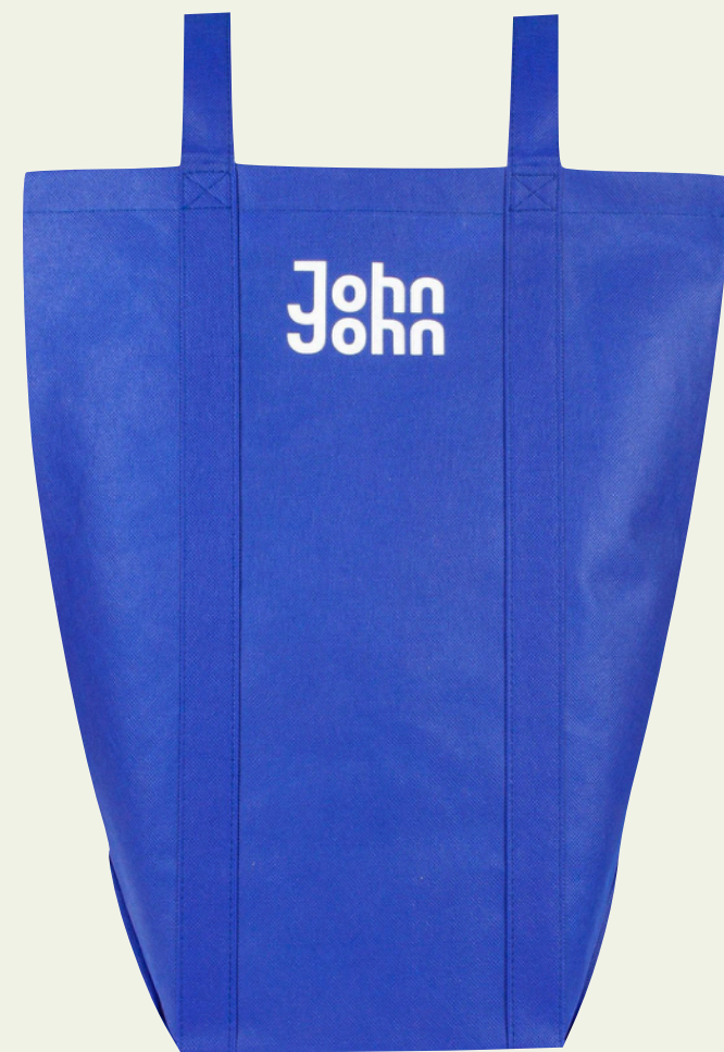
John John STANDARD

Made from recycleable or recycled plastic. Cost-efficient, durable, colorful and proven a million times over. The price-performance winner