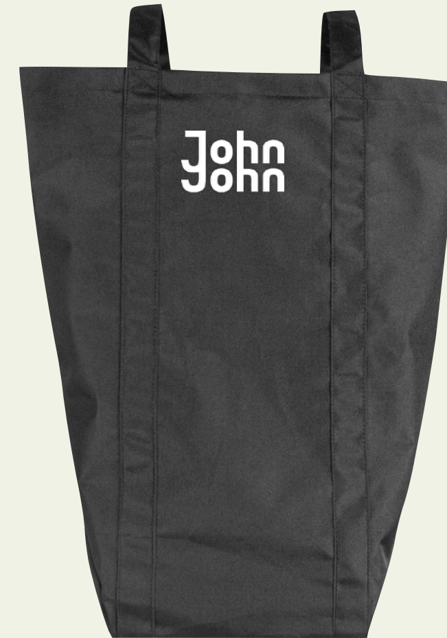
John John HEAVY DUTY

Our heavyweight made of extra thick recycled polyester. Is this still a bag or already a real backpack? Need a little more?