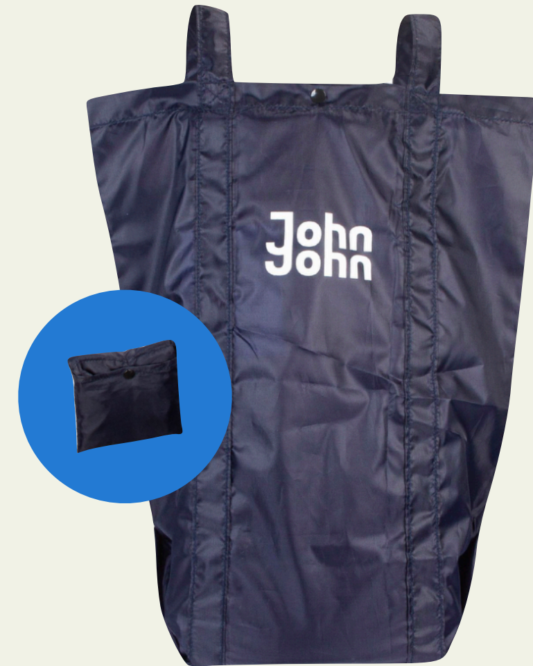
John John PACKABLE

Made from recycleable or recycled plastic. Cost-efficient, durable, colorful and proven a million times over. The price-performance winner