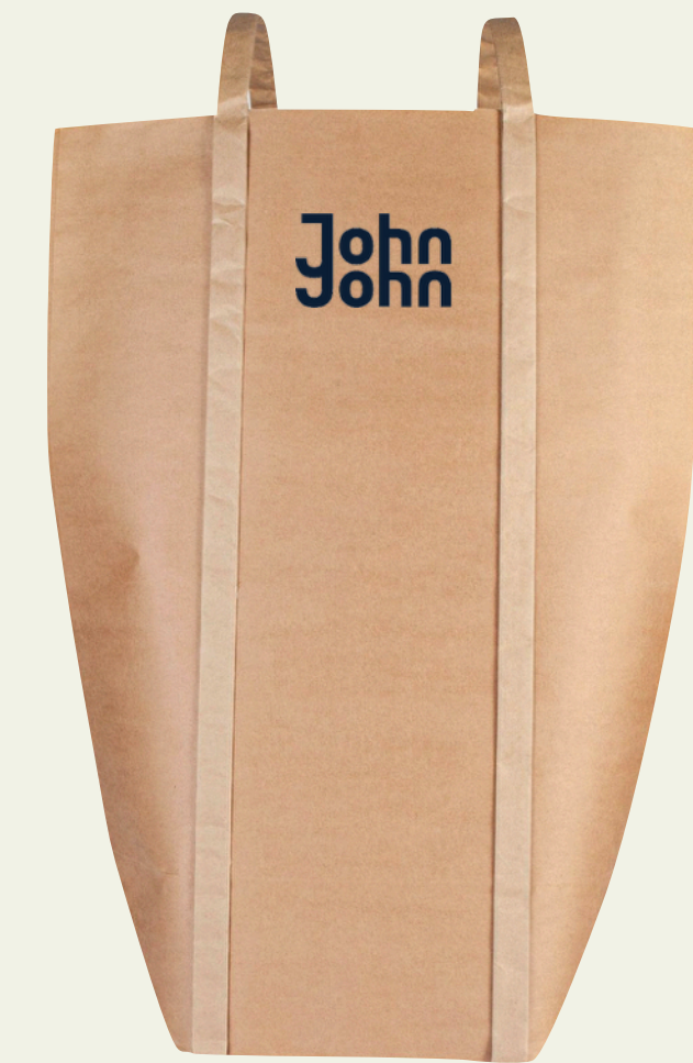
John John PAPER

Made of kraft paper with a high amount of recycled fibers, this classic is our most affordable bag for the back.